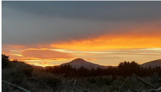
Waikouaiti Beach Planting area