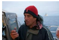
Runaka update: Employment Opportunity